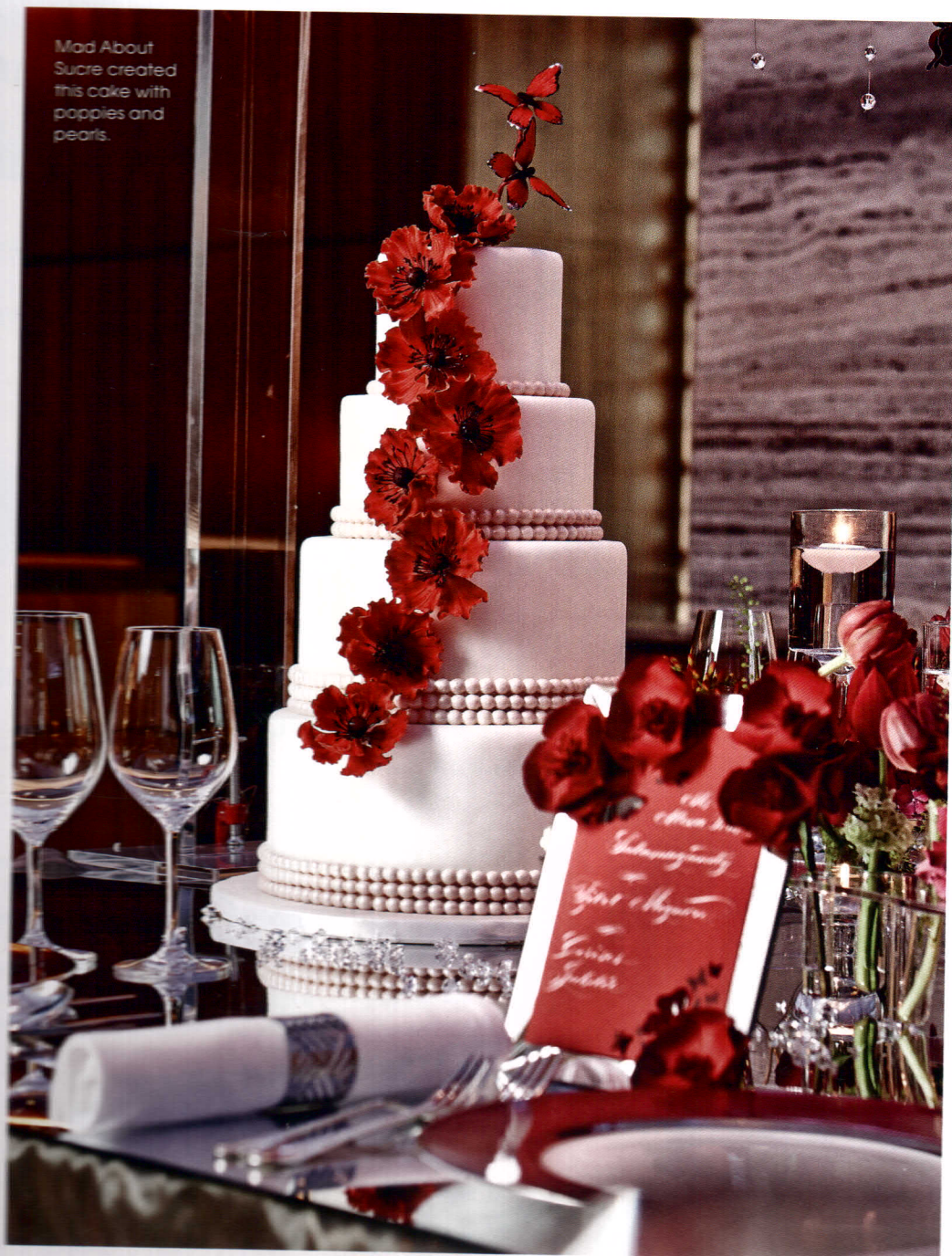
Mad About Sucre created this cake with poppies and pearls.

“Our concept is for a bride who wants a creative theme with fine details. She is a woman who trusts us to bring her vision to life.”